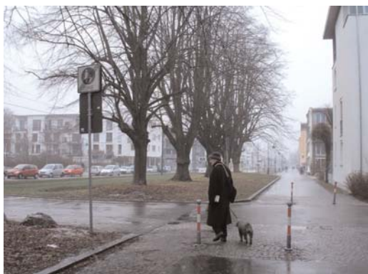
Existing trees have been preserved