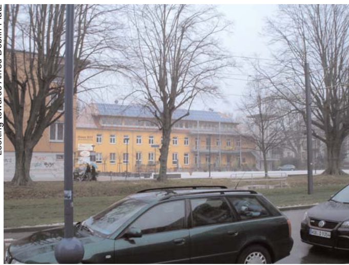
Looking towards Alfred Doblin Platz